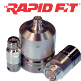
RAPID FIT™ Connectors